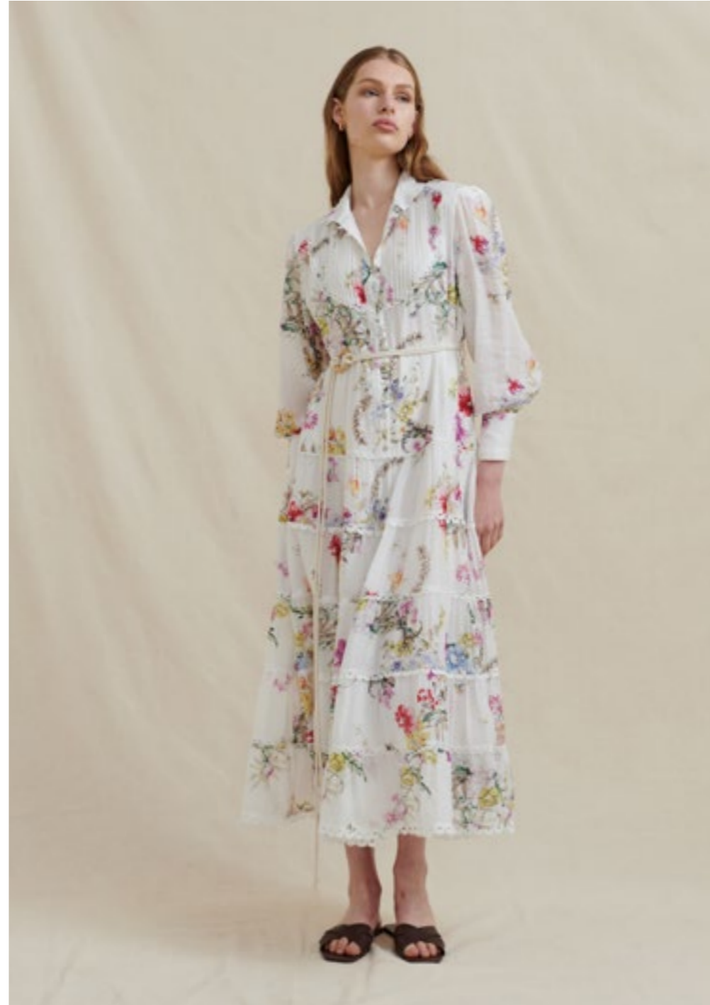
AN1014 Charlotte Maxi Dress

Wild Flower, Sunset 70% Viscose 30% Nylon XS - XL