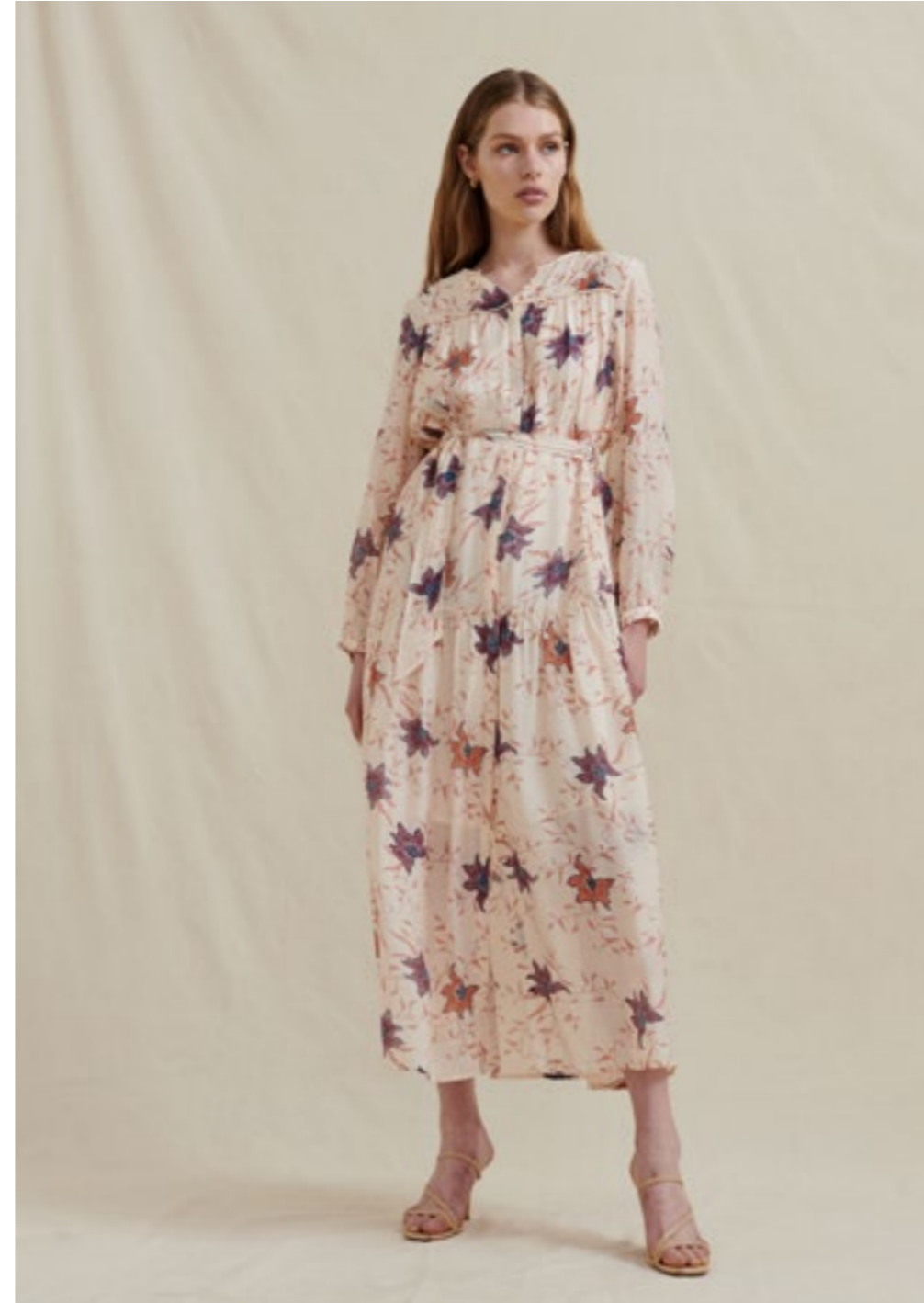
AN1012-1 Nina Maxi Dress