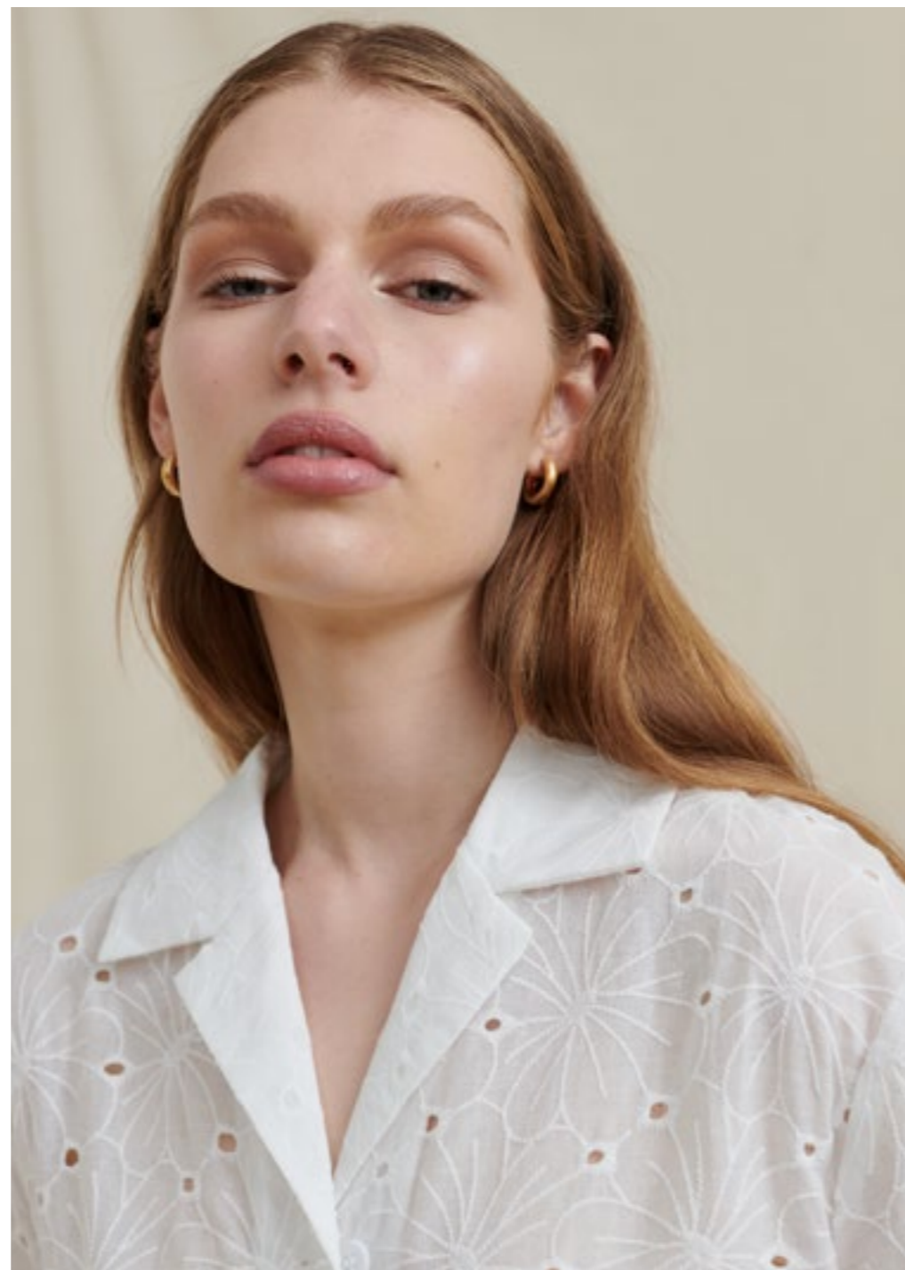
AN1018 Emily SS Shirt