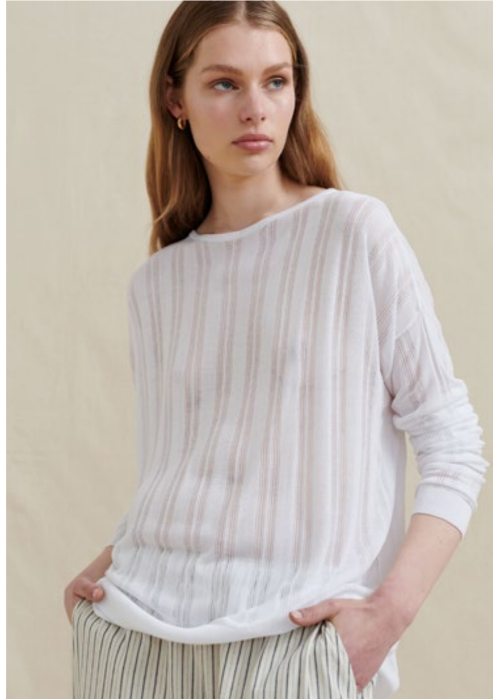
AN1037 Dalton Knit Pullover