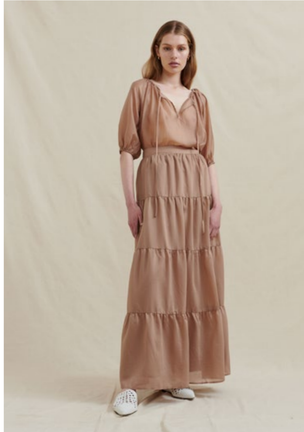
AN1013 Charlotte Blouse