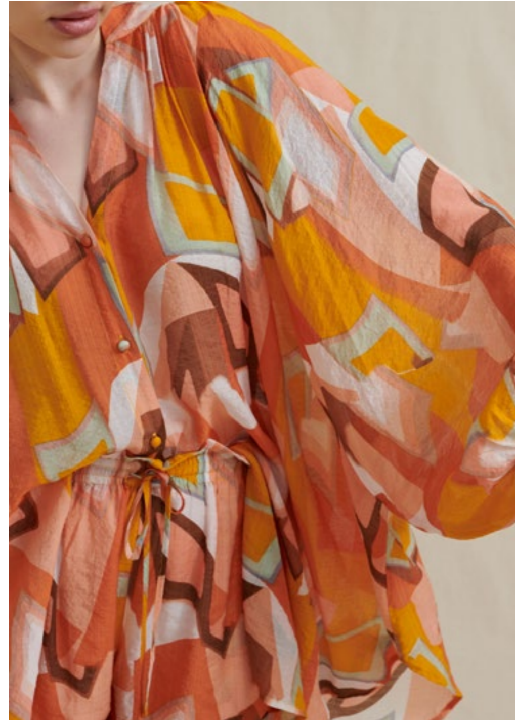
AN1058 Grace Shirt Dress