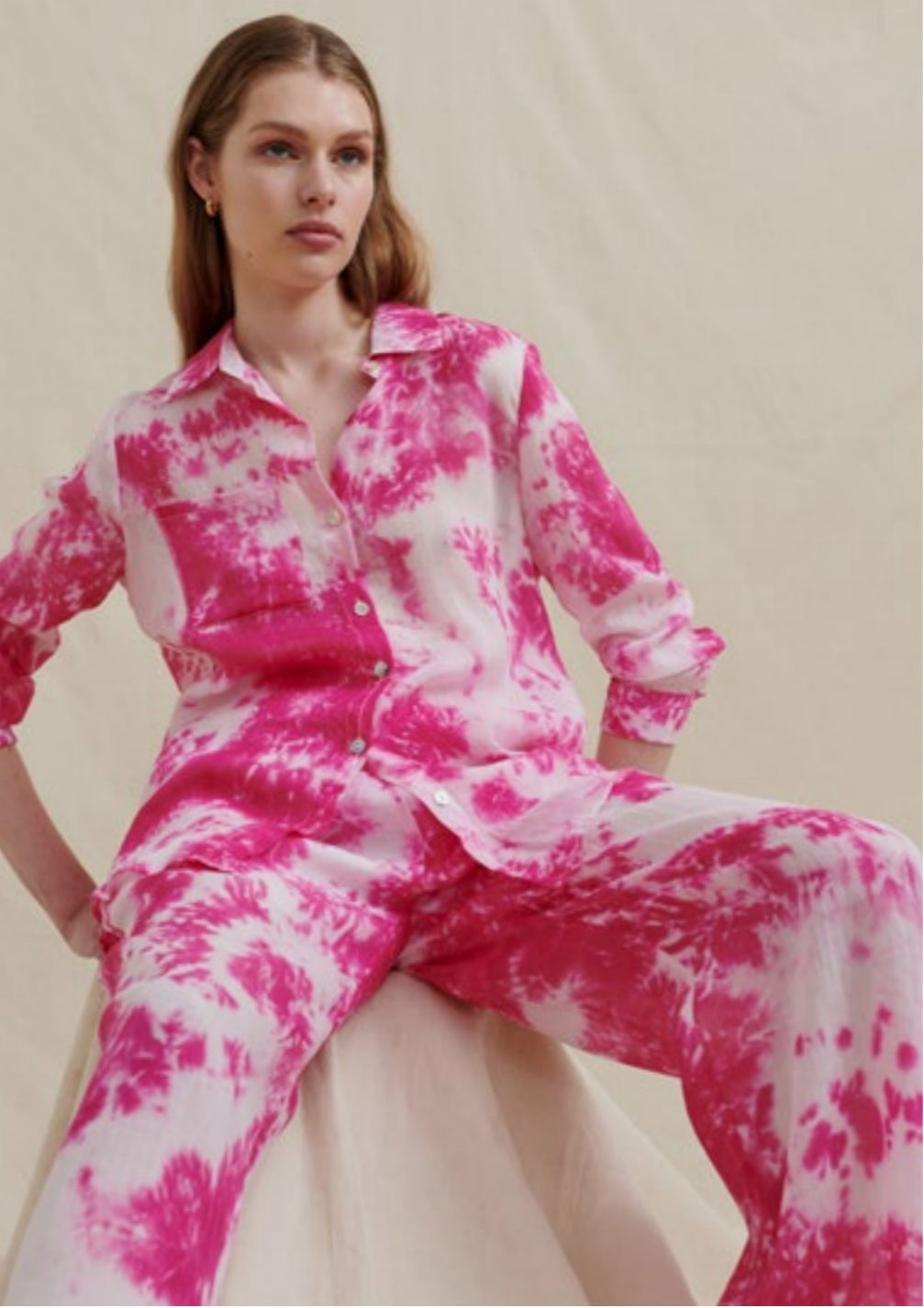
AN1044-1 Goldie LS Shirt