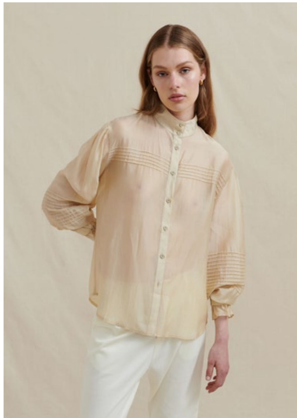
AN1021 Shay LS Shirt