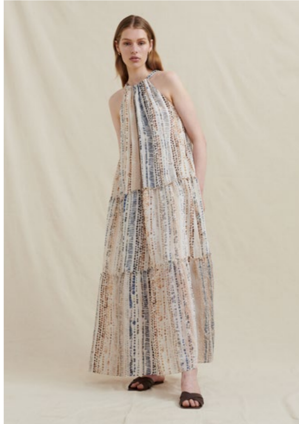
AN1055 Goldie Maxi Dress