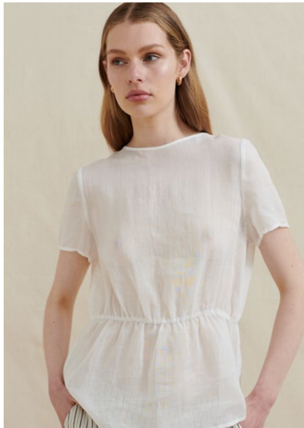
AN1050-1 Cave Tee