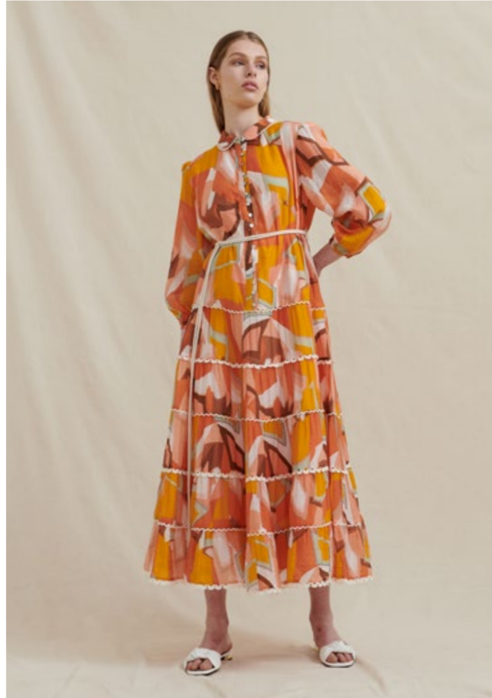
AN1064 Grace Maxi Dress

Sunset, Wild Flower 70% Viscose 30% Nylon XS - XL