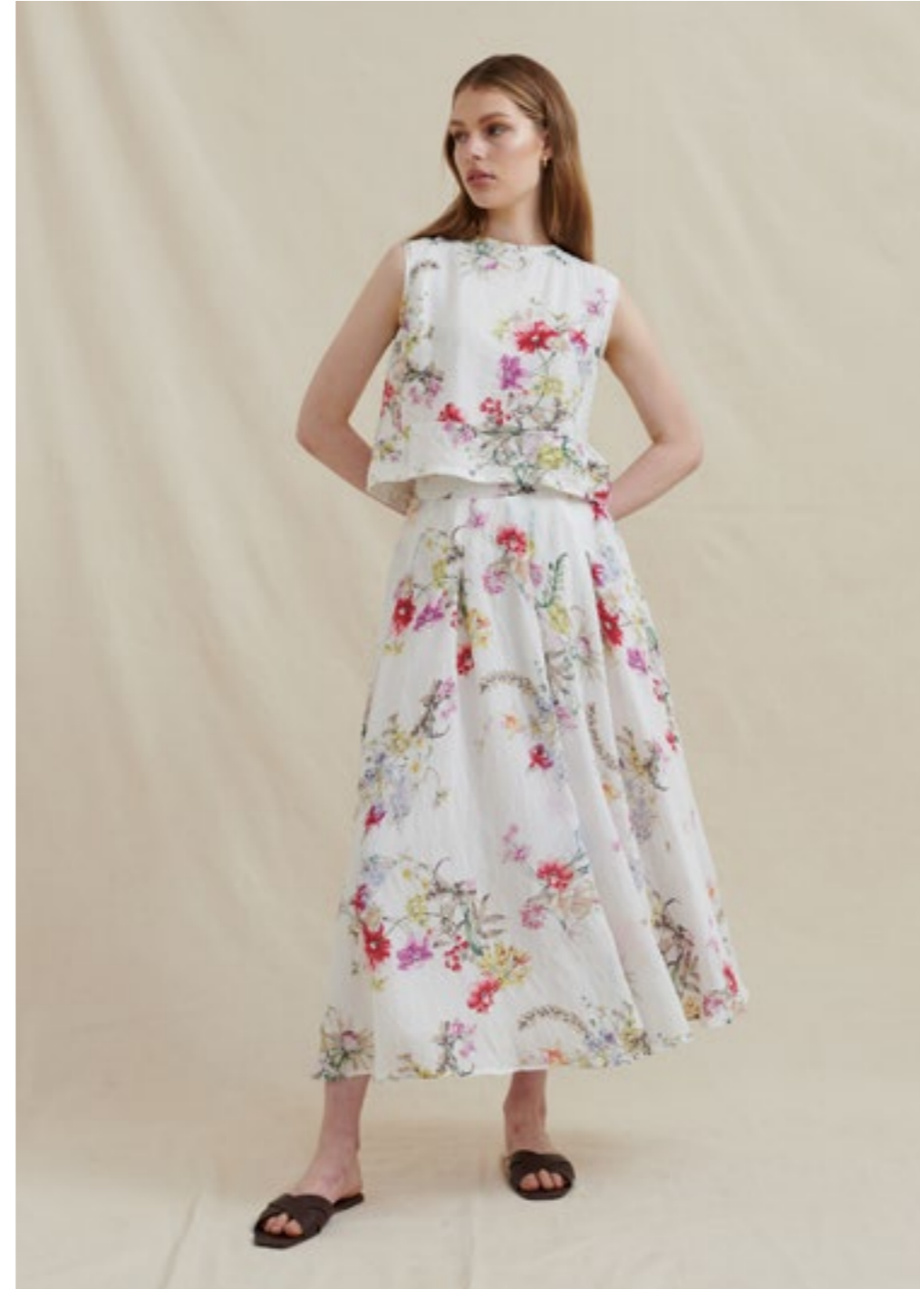
AN1015-1 Charlotte Top

Wild Flower 70% Viscose 30% Nylon XS - XL