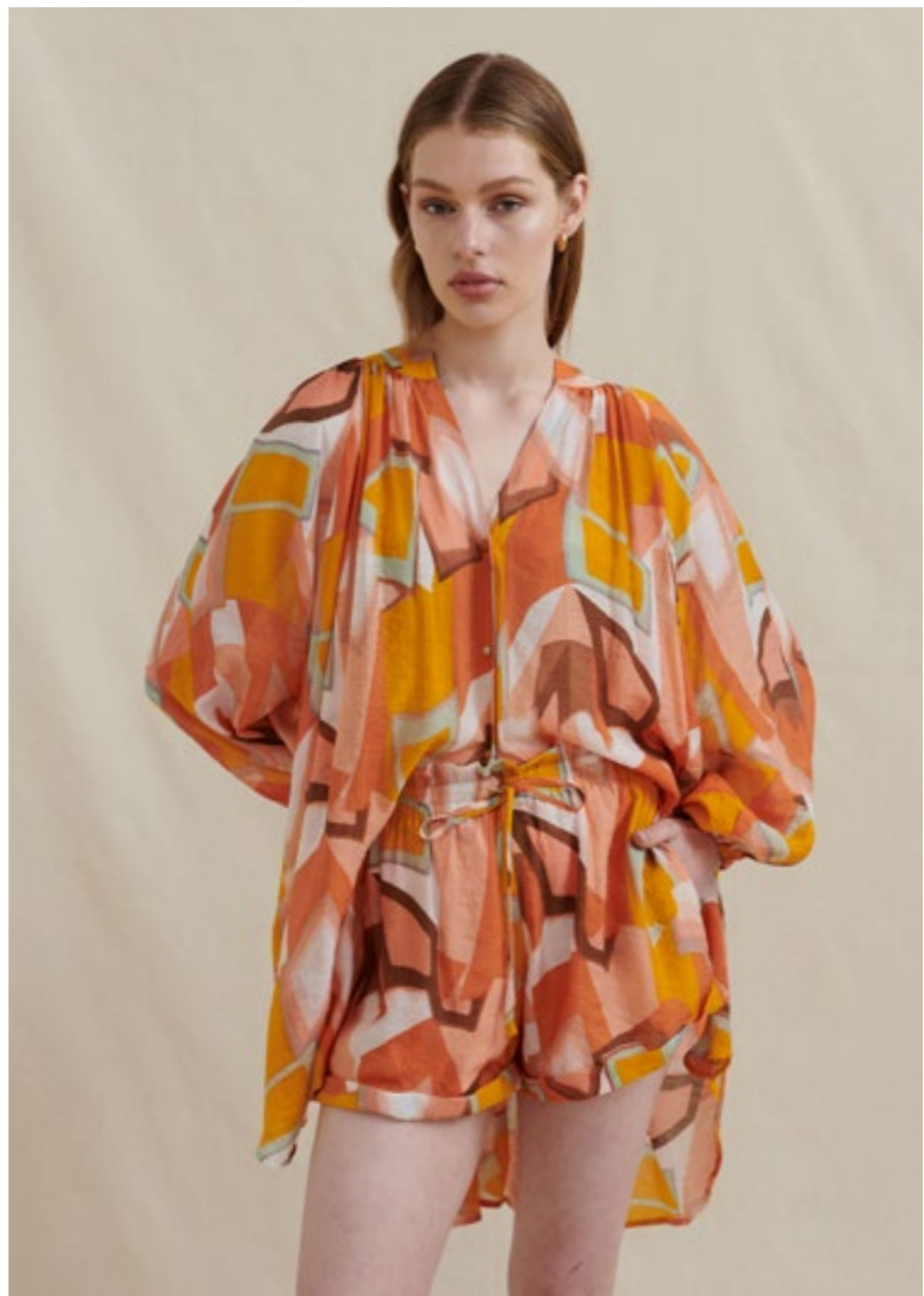
AN1053 Grace Shorts