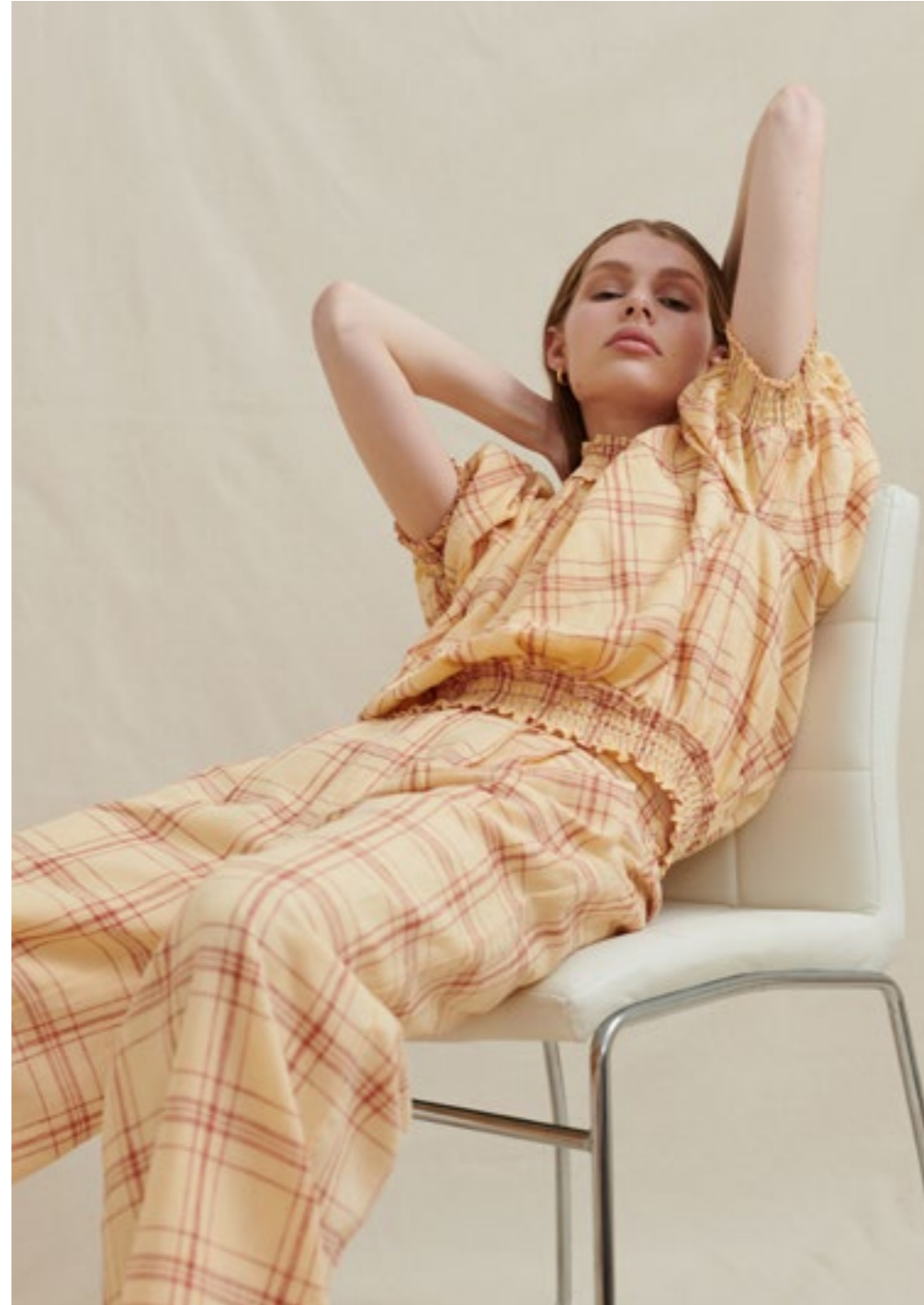
AN1057-2 Nina Blouse