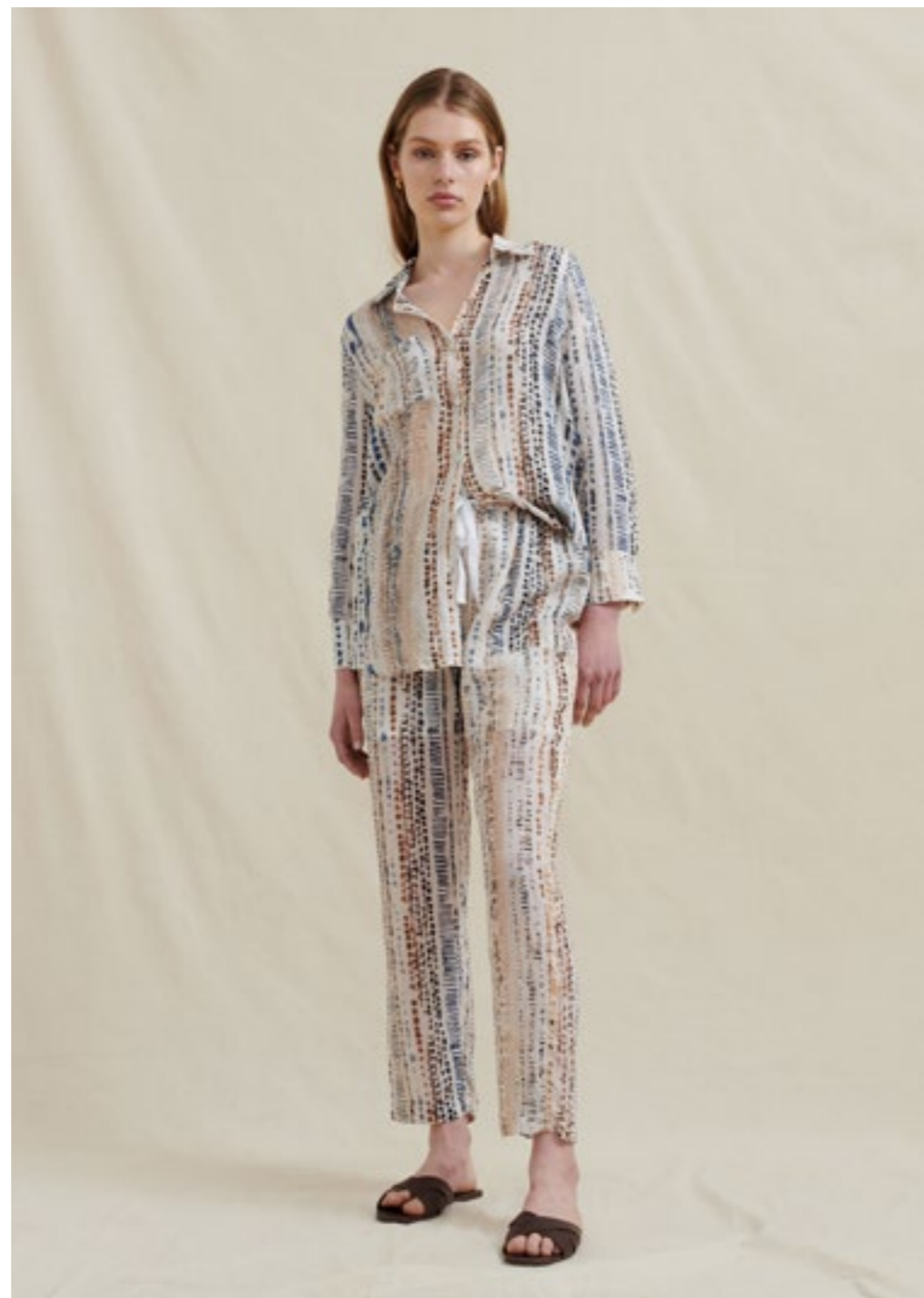
AN1044 Goldie LS Shirt