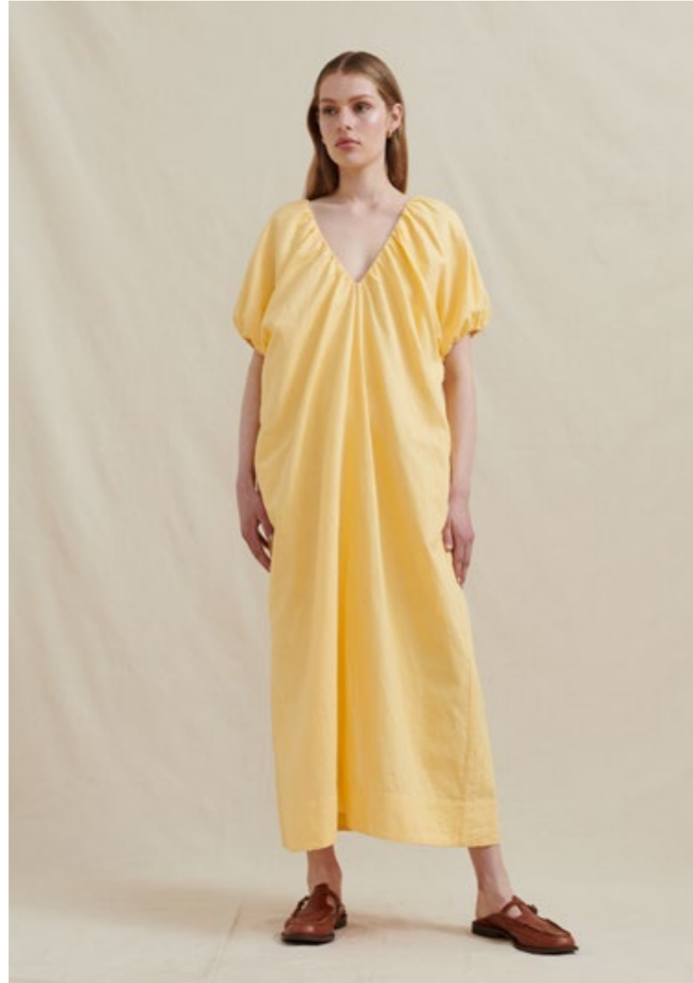
AN1049 Penny Midi Dress