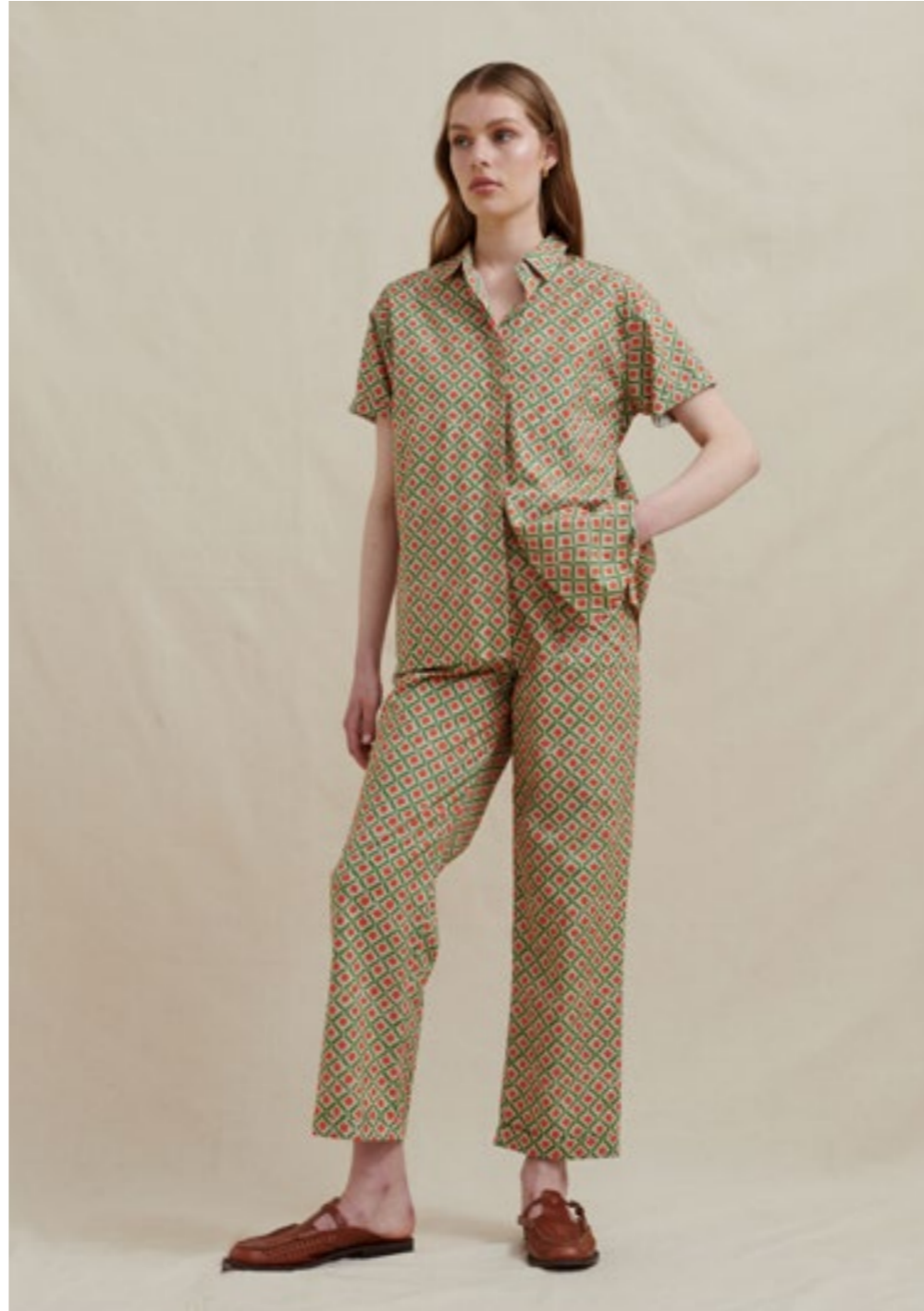
AN1032 Rowland SS Shirt