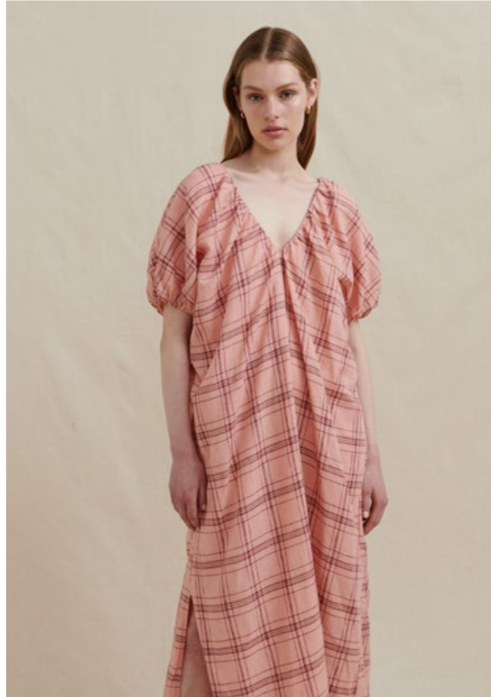
AN1049-1 Penny Midi Dress

Salmon Check 75.5% Linen 24.5% Cotton XS - XL