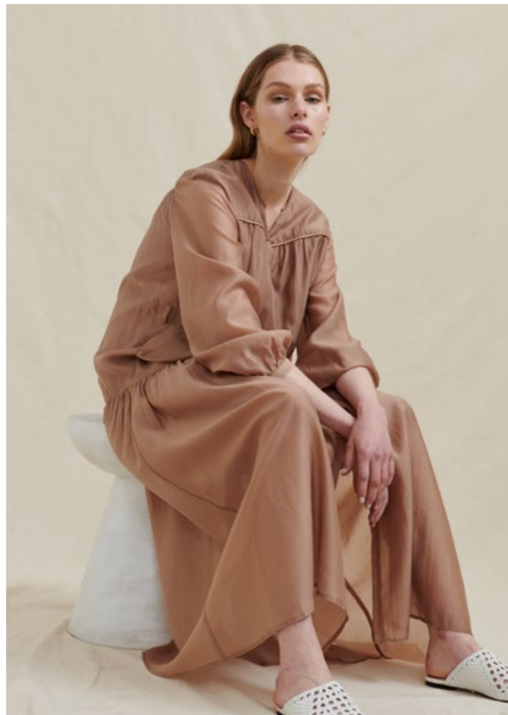
AN1012-1 Nina Maxi Dress