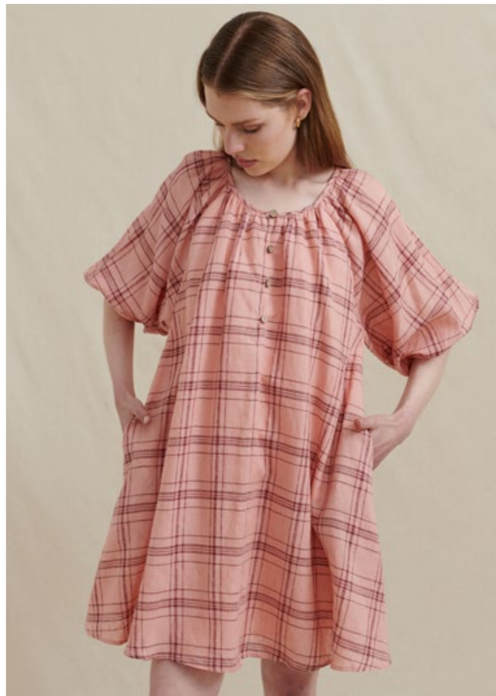
AN1062 Joni Mini Dress

Salmon Check 75.5% Linen 24.5% Cotton XS - XL