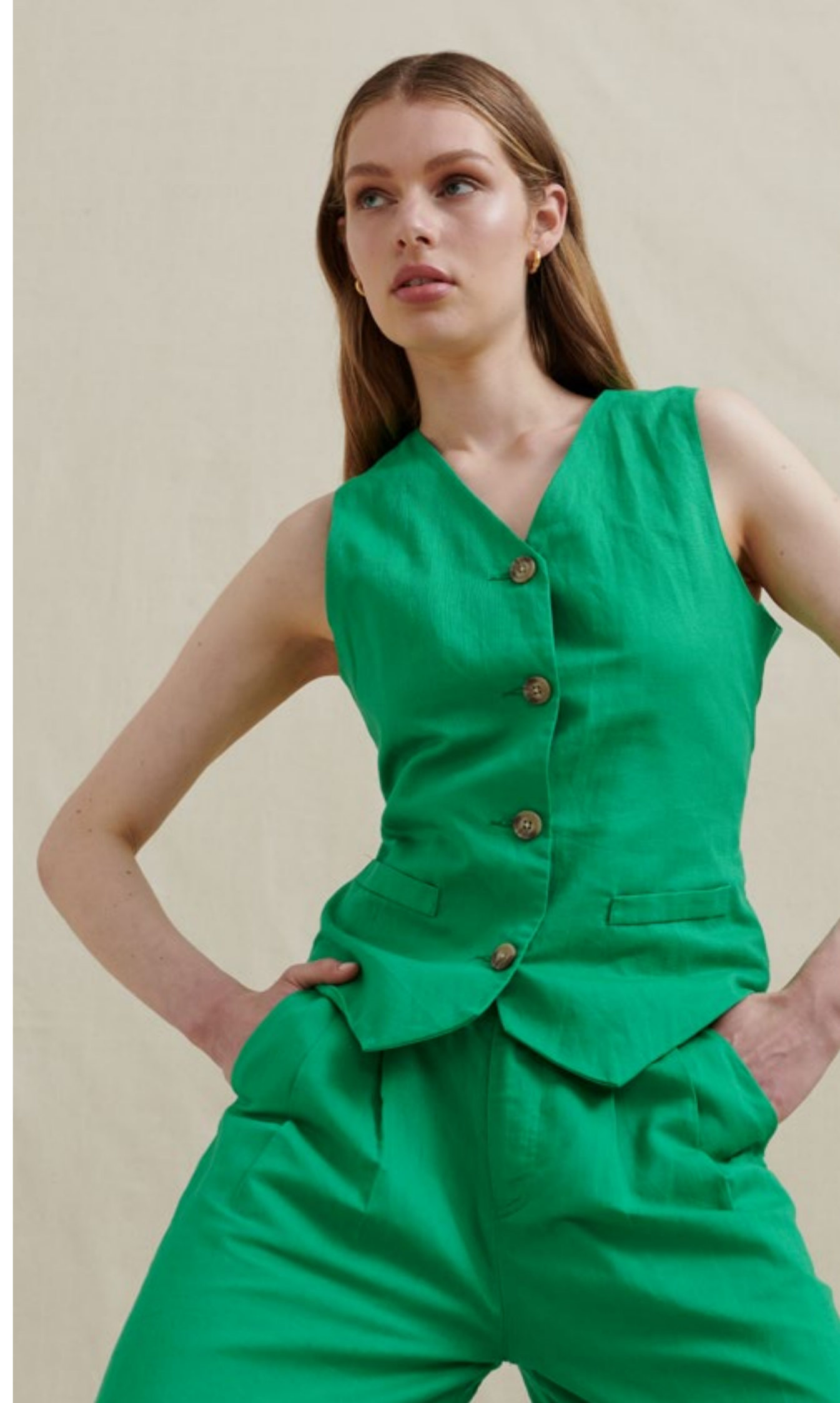
AN1008 Zig Vest AN1008-1 Zig Wide Leg Pant

Green, White 55% Linen 45% Nylon XS - XL