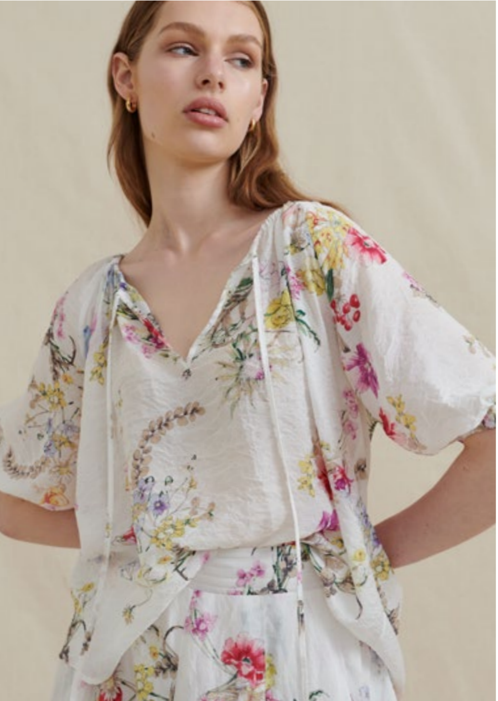
AN1016 Charlotte Top