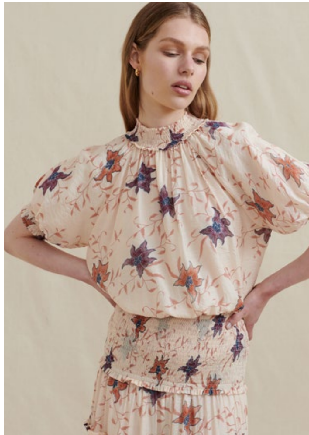
AN1057-1 Nina Blouse