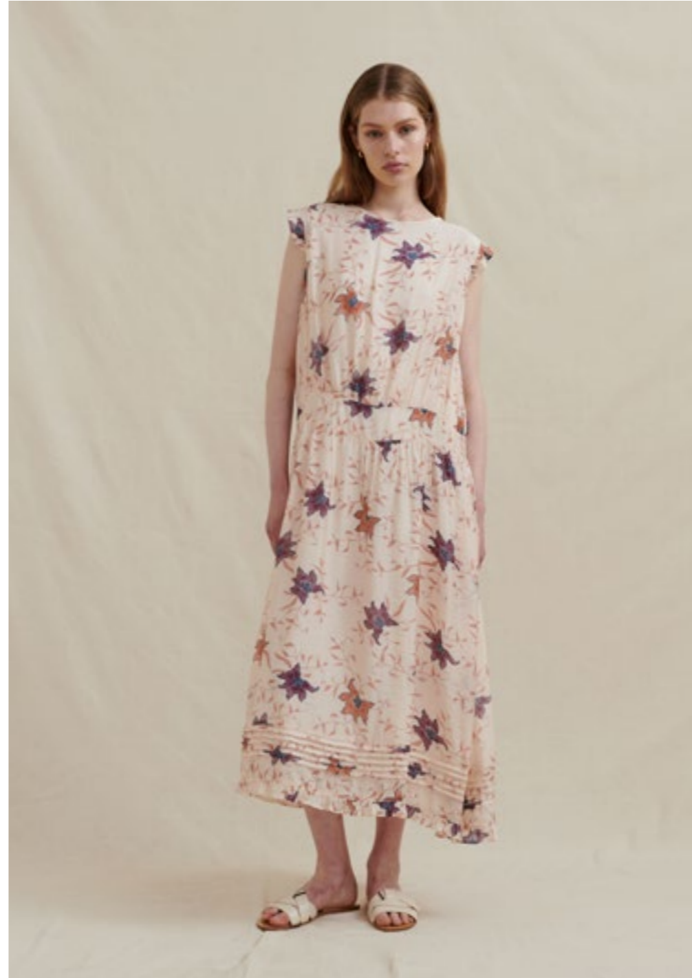
AN1020 Nina Midi Dress