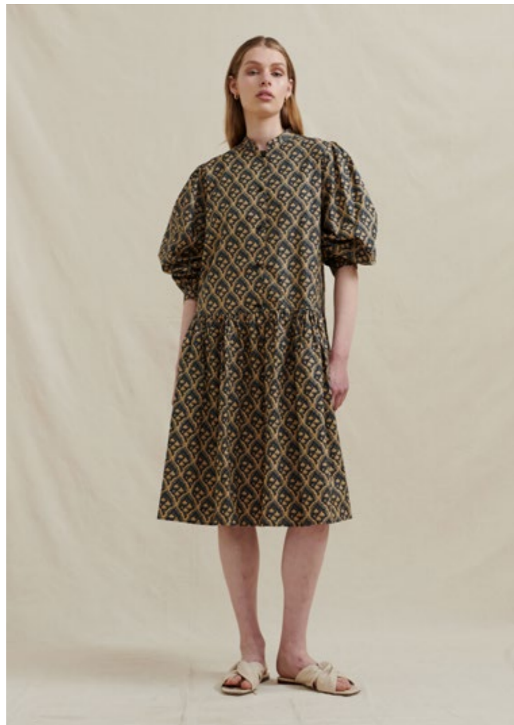
AN1009 Fields Midi Dress