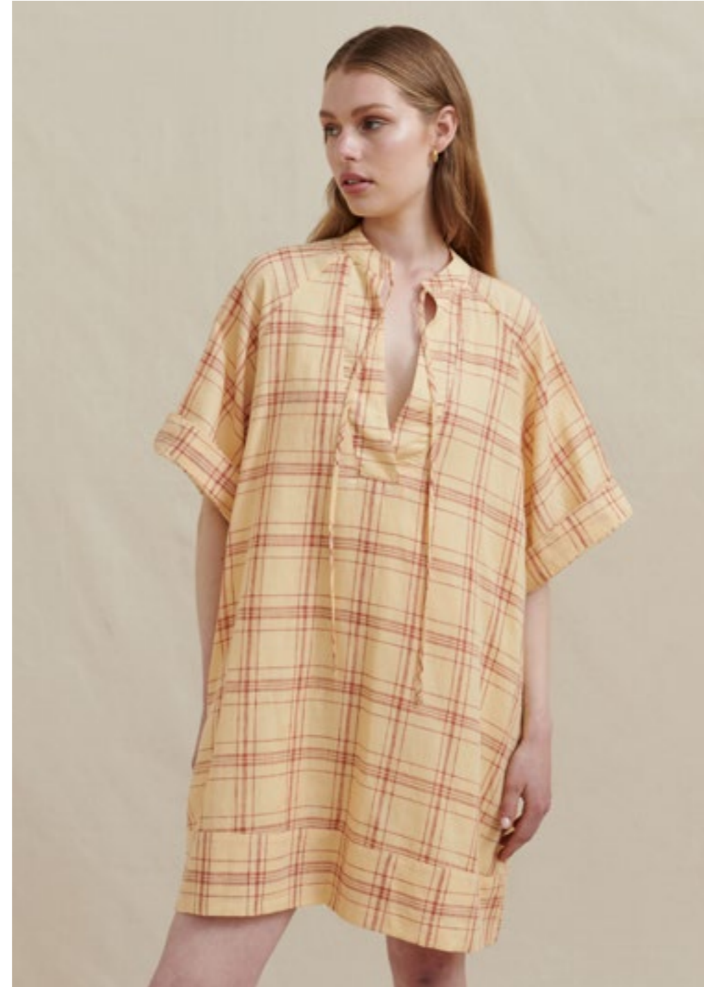
AN1043 Morgan Mini Dress

Buttermilk Check 75.5% Linen 24.5% Cotton XS - XL