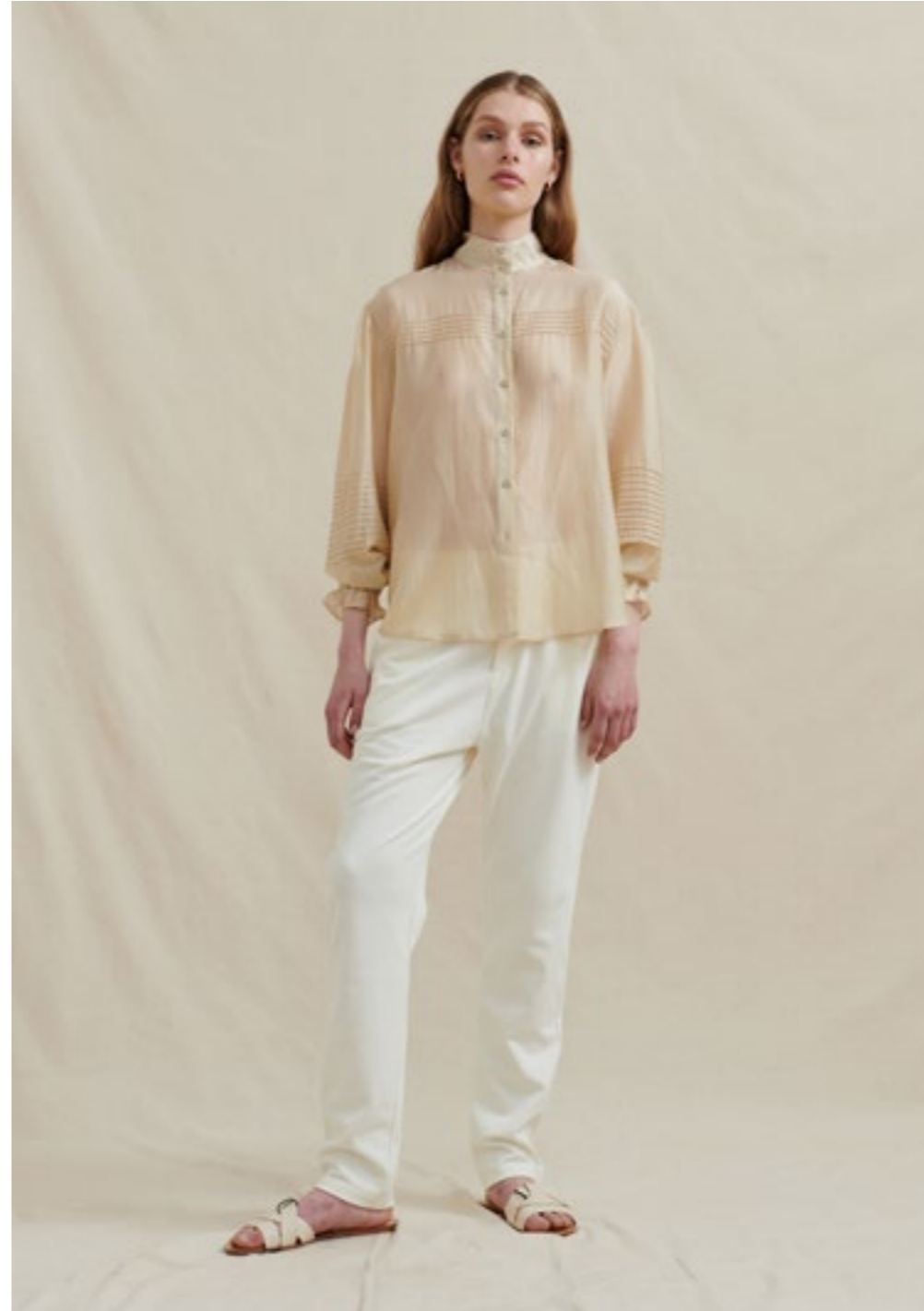
AN1022 Tracksuit Trouser

Milk, Navy 85% Cotton 15% Polyester XS - XL