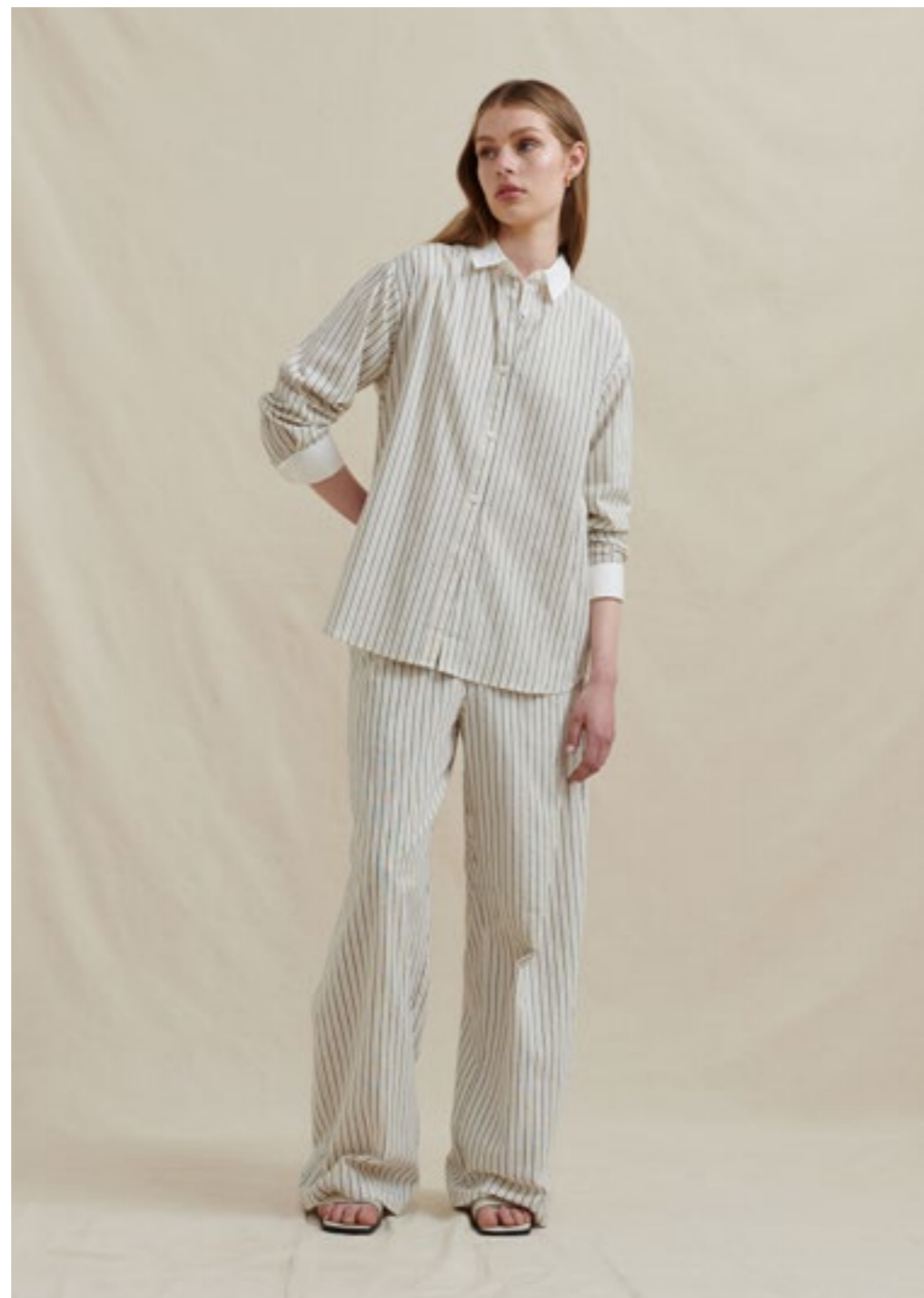
AN1004 Smith Pant