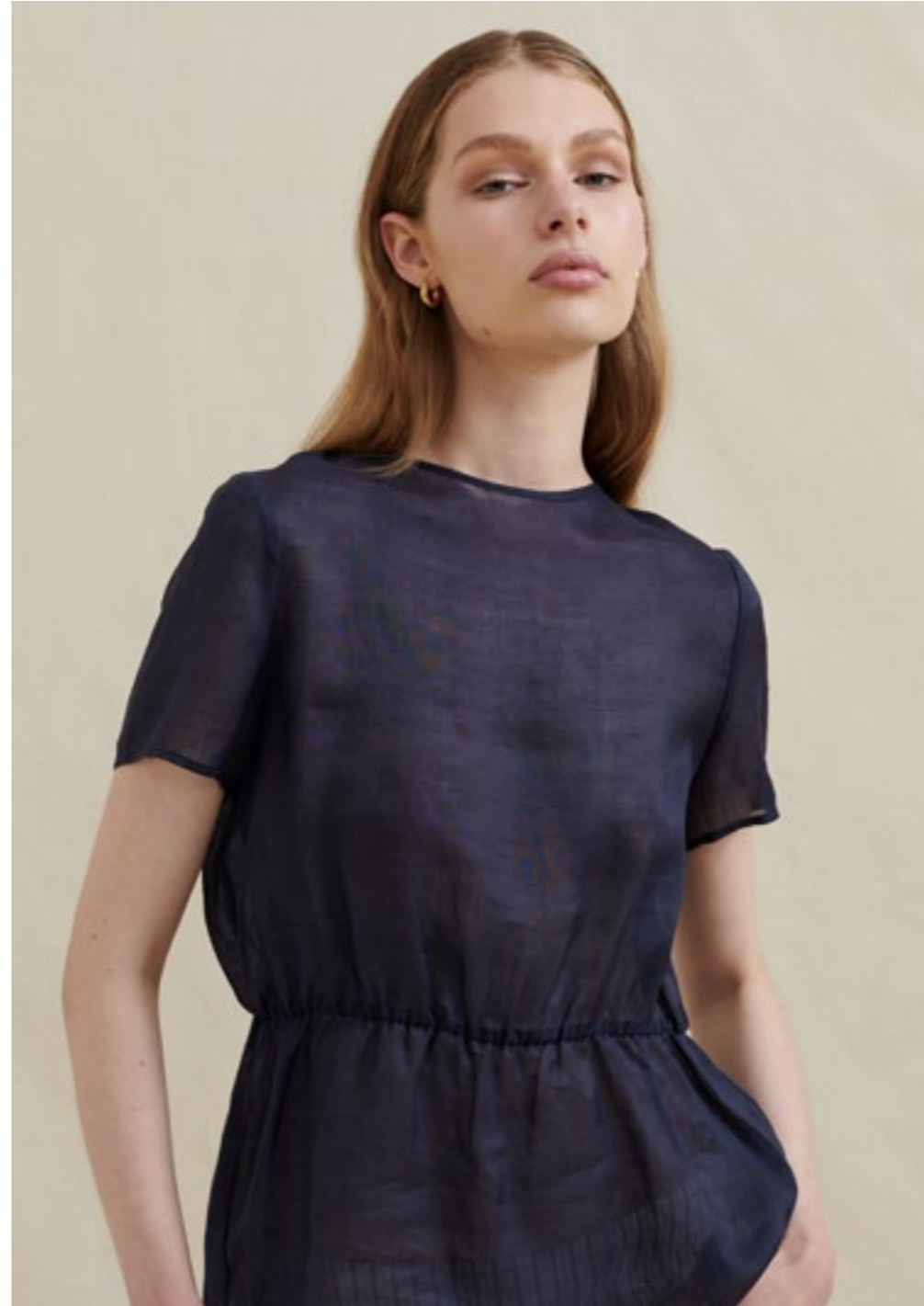
AN1050 Cave Tee